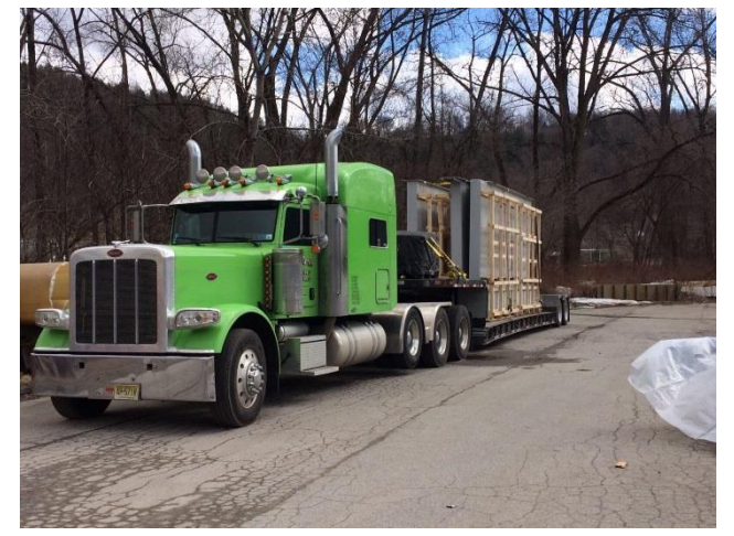
SAFB being delivered to site in NYC.