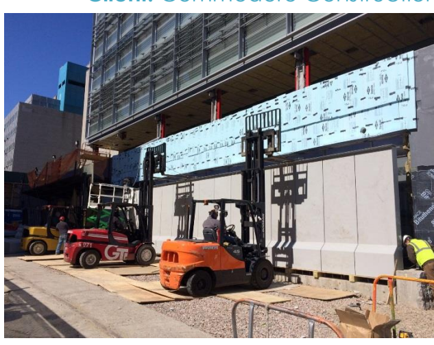
Installation works begin.