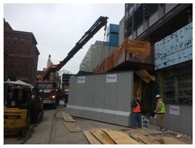
SAFB being installed. Barrier shown at 50% deployed.